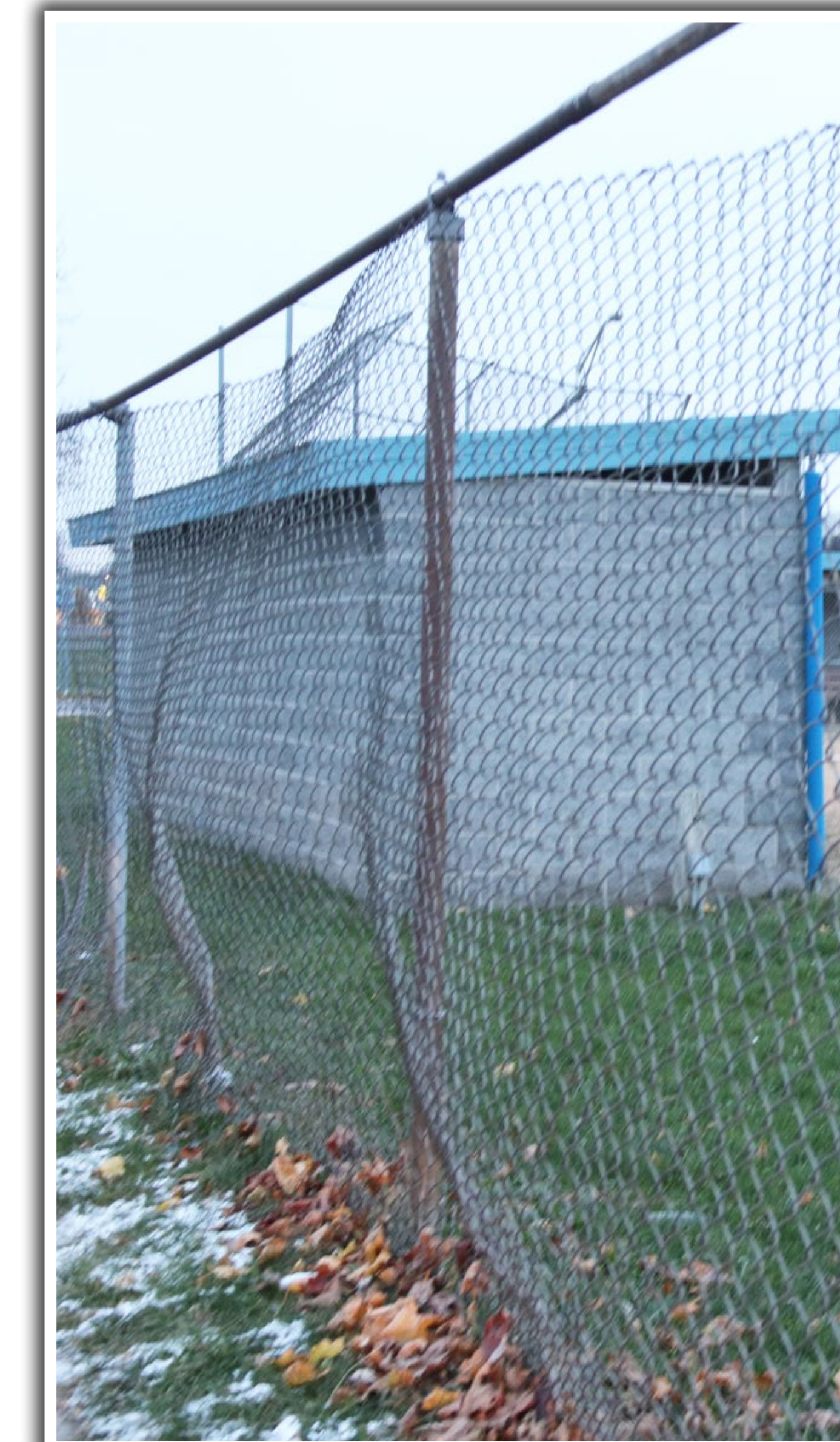
Main Campus Field Work

For Full Capital Project Information, please visit: www.oswego.org/capitalproject