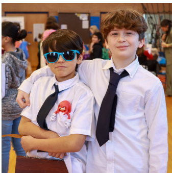
Fitzhugh students show off their finest business attire at Career Day.