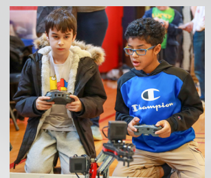
KPS students explore the OMS robotics setup during STEAM Night.