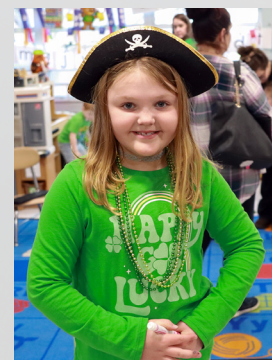
A CER student shows off her pirate hat while finishing up a classroom activity during Pirate Night.