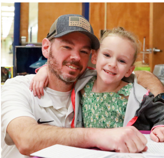
Families participate in different activities during literacy night.

Leighton Elementary students recently participated in a reading challenge, and they celebrated their achievement during this year's family literacy night.