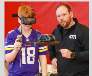
At the Citi BOCES drone station, a KPS student operates a VR drone.

Event organizers extended their gratitude to all participating organizations, volunteers, and staff members who made this event a resounding success.