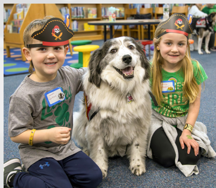
Two Charles E. Riley Elementary School students enjoy the company of a therapy dog during the recent Pirate Night.

As part of a family engagement effort, Charles E. Riley Elementary School recently transformed into a swashbuckling adventure as families gathered for the second annual Pirate Night.